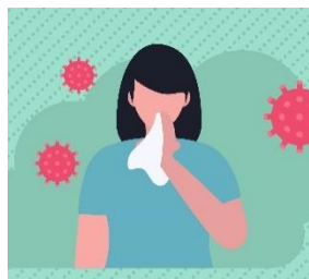
Use tissues, then throw them away