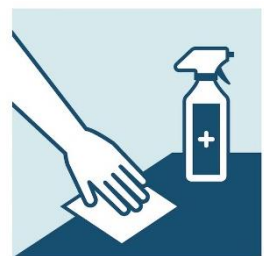
Keep objects and surfaces clean

Call your doctor again if you are getting worse. Call back if you are having trouble breathing. Do what your doctor says.